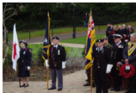
Parade at Malvern