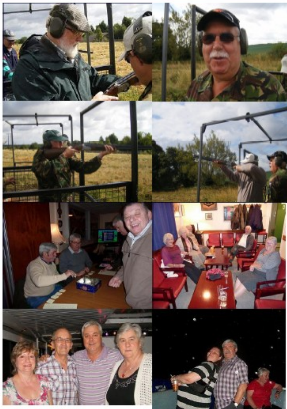
The River Severn Boat Trip, The Race night, Clay pigeon shooting At Tyddesley Wood Range.