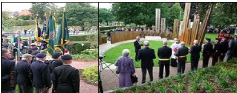
The grand opening of the Gheluvelt Memorial Park and the new memorial, At Worcester on August 14th.