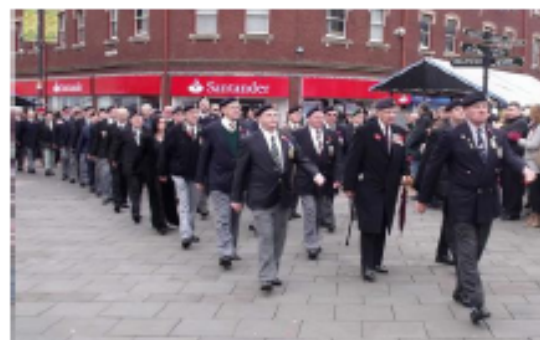
The Walsall branch at Walsall