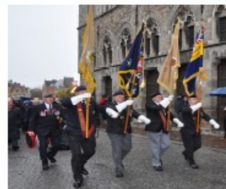
Stockport parading at Leper.