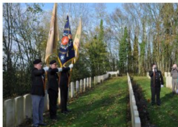
Trammere, Stockport Cheshire Regiment Association And Stockport Mercian Volunteers Association laying a wreath in Belgium