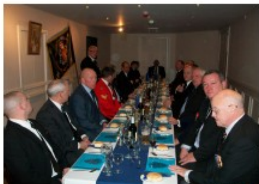
Stockport Branch Dinner held on Saturday 27th November at the Armoury Inn Stockport