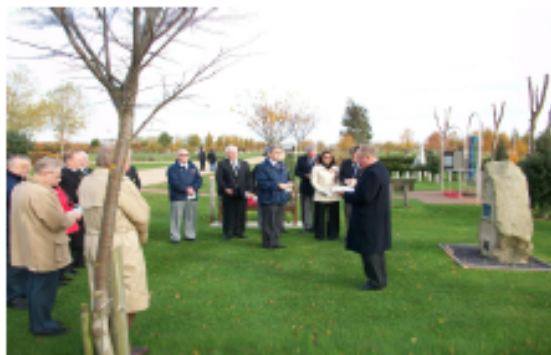
The Kidderminster Branch at the Hales Owen Parade

A short service was held at the Association's Memorial at the National Memorial Arboretum, Alrewas on November 3rd before the Committee meeting. A wreath was laid on behalf of the Members.